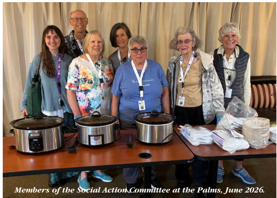
Members of the Social Action Committee at the Palms, June 2026.