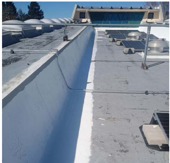
Spreading silicone coating on the roof of the sanctuary and social hall to seal leaks.