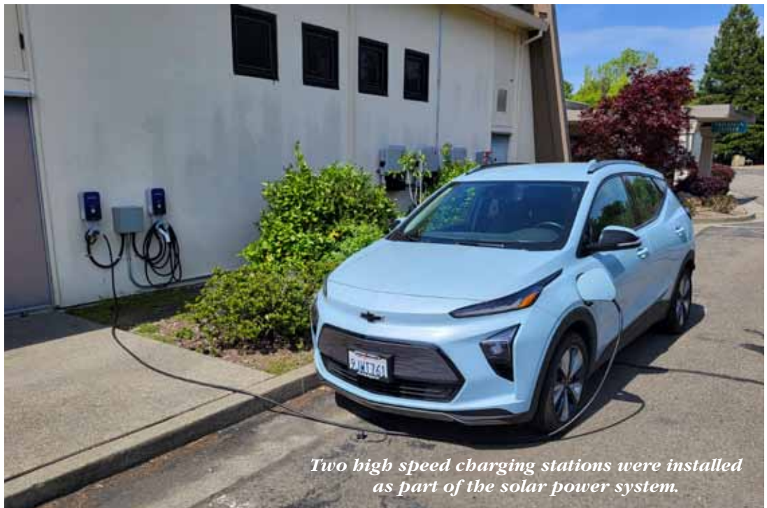
Two high speed charging stations were installed as part of the solar power system.