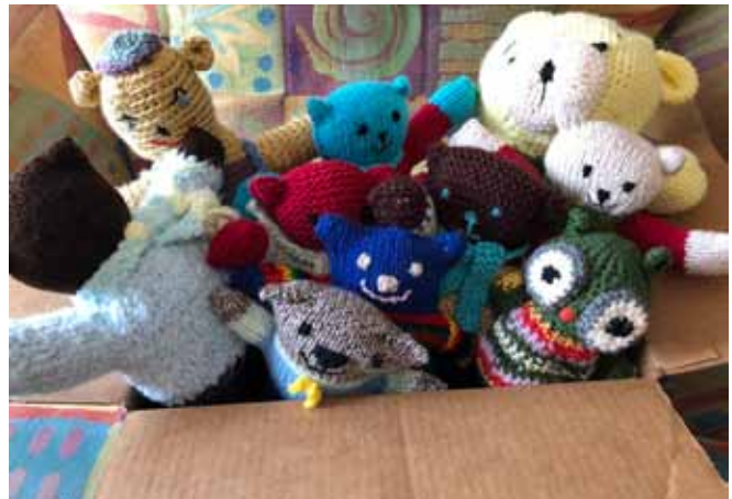
The teddy bear crafters are expanding into other species.

Other bears have been given to patients in the pediatric oncology unit of Hadassah Ein Karem Hospital. And a recent cohort went to a program in Nahariyyah that serves kids on the autism spectrum. So they're all finding homes where they will do a teddy bear's job of giving comfort and consolation.