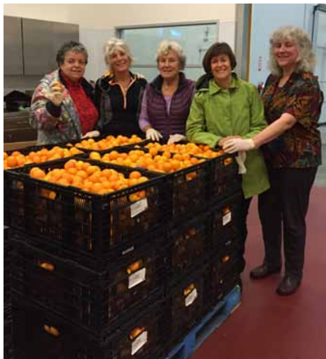
Social Action Committee members pose while volunteering at the Redwood Empire Food Bank in December of 2014.

The US Department of Agriculture (USDA) has cancelled $500 million in Emergency Food Assistance Program (TEFAP) food deliveries through the fiscal year 2025. This has resulted in the loss of 9 truckloads of food: 155 pounds of milk, eggs, canned meat, and dried fruit valued at $700,000 for REFB between April and June. Also the USDA ended the Local Food Pur-