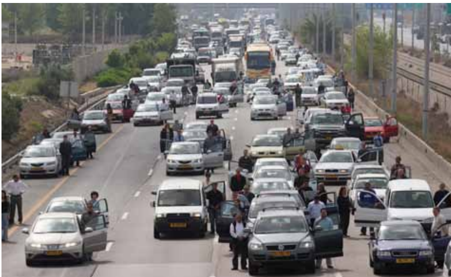
Traffic in Israel stops as a siren sounds to mark Yom HaShoah