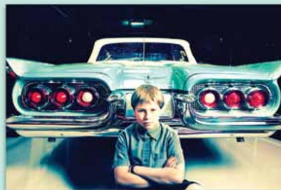
His Sign-in Board

WellnessAcupunctureTherapy.com WellnessAcupunctureTherapy@yahoo.com 6570 Oakmont Drive, Suite #D, Santa Rosa