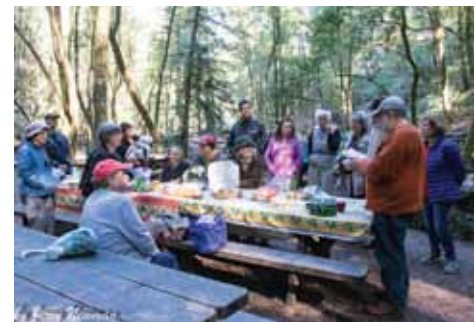
Beth Ami celebrates Tu B'Shvat 5780 (2020) in Armstrong Woods