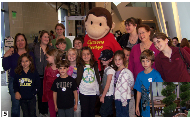
Religious School field trip to the Contemporary Jewish Museum and KRON TV-4 in San Francisco (photos 3,4,5)