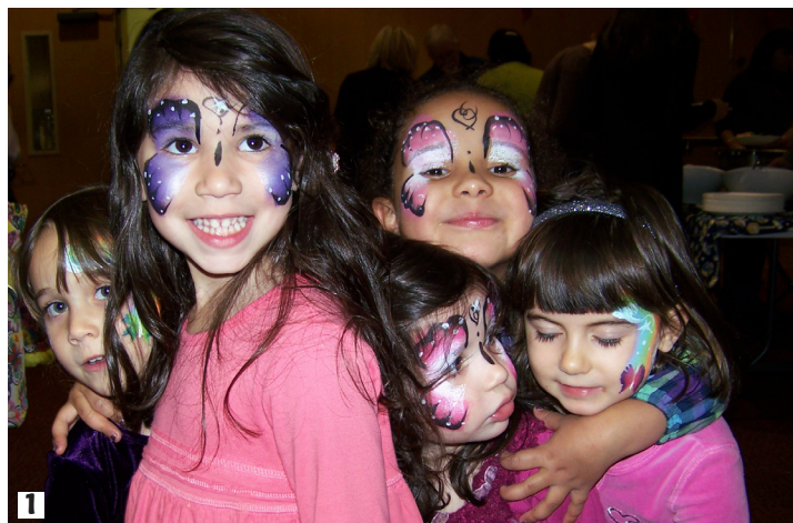
Face painting and fun at the annual Chanukah Latke Party (photos 1 and 2)

Happy New Year! I hope that you've all had a restful and rejuvenating time off and are ready for Tu B'Shevat, Purim, and then Pesach! We have the Promise Haggadot available to order. They make a superb addition (or beginning) to your Jewish home celebration library. They will be personalized with your name(s) and are geared toward families who would like a fairly short Seder. The Haggadah is written in English, Hebrew, and is also transliterated. We have sample copies in the Religious School office for you to peruse at your convenience. This is a RS fundraiser, so please place your orders early. Please see the flier on the facing page. May you have Shalom Bayit always (peace in your home).